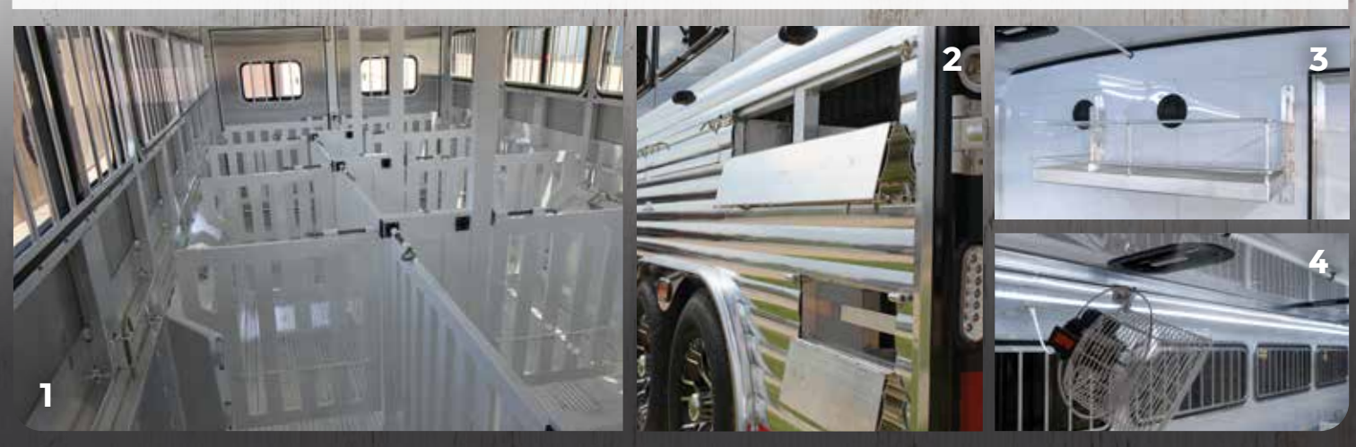
CUSTOM OPTIONS: (1) Powder Coated Pens (2) Hinged Cover Panels (3) Removable Shelf/Tray (4) Fans and Misters For more options, log on to www.exiss.com or visit your local dealership